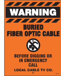
9" x 12"