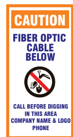
4" x 12"