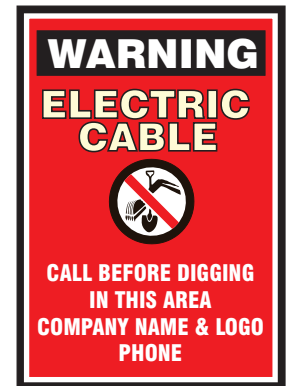
14" x 20"