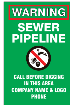
12" x 18"

Ensure visibility from both the front and the back by having a warning message printed on both sides. The back side message is laid out to accommodate the support post.