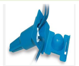
Part # SCB-01SR

Copperhead Industries, LLC Monticello, MN 55362 Customer Service 877.726.5644 Fax 763.271.3694 www.copperheadwire.com